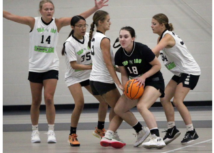
Girls action from the 2023 Expo.

The top high school players in Minnesota for the 2024-2025 season, as projected by the Minnesota Basketball News staff along with assistance from high school head coaches, have been identified and placed on a Watch List. All Watch List players are being invited to show their talent to college coaches and the MBBN staff at the Top 100 Expo Showcase.