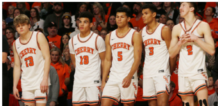
Most of Cherry's state champ lineup returns.

All games will be played at Clemens Fieldhouse (Haehn Campus Center) and are open to the public as an admission event. Trainers and concessions are provided by the host school, St. Ben's.