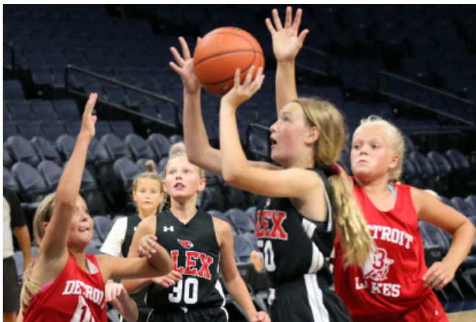
Alexandria and Detroit Lakes duelled in 2023.

All youth teams in “Great State” will play 3-4 games on one day only. Teams will attend the Lynx game on Thursday, July 4, at 7 p.m., vs. the Connecticut Sun, or Saturday, July 6, at 7 p.m. vs. the Washington Mystics.