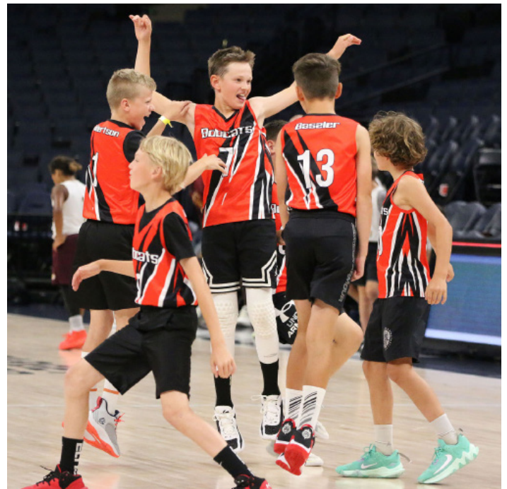
Brookings celebrated a close win in 2023.

The Pacesetter “Great State” tournament began in 2010 as the Great Four-State championship and added Wisconsin in 2018.