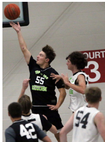
Boys action from the 2023 Expo.

Each November, MBBN publishes the Top 100 players, 50 boys and 50 girls, in each class in the pre-season issue, which also names the Top 20 teams in each class. Two hundred boys and 200 girls will be recognized. Over 300 boys and 300 girls with "college potential" have been named to the Watch List and provided invitations to the Expo for further exposure and networking.