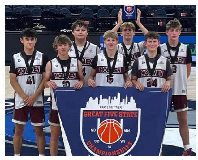
HOLMEN 8TH GRADERS